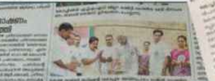
നാലാം നമ്പർ... നവംബർ 1998

പ്രകരണികൾക്കായി ഡയാലിസിസ് ചലഞ്ചറായി ഹൈബി ഊഡൻ എംപി