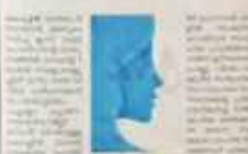
നാലാം നമ്പർ... നവംബർ 1998