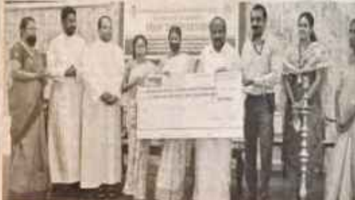
നാലാം നമ്പർ... നവംബർ 1998